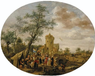
JAN STEEN (LEIDEN 1625/6-1679) A VILLAGE FAIR WITH A PAMPHLETEER

The live sale of European Art Part I achieved a total of $6,639,250. The top lot of the sale was Carl Spitzweg's Der Hexenmeister , which was recently restituted to the surviving heirs of Leo Bendel, and sold for $1,230,000 against a low estimate of $300,000. Additional notable results include William Adolphe Bouguereau's Rêverie , which sold for $930,000; Gustave Courbet's Bords de la Loue avec rochers à gauche , which realized $798,000; and Vittorio Matteo Corcos' Alla fontana (Le due colombe) which achieved $687,500. Browse sale results here.