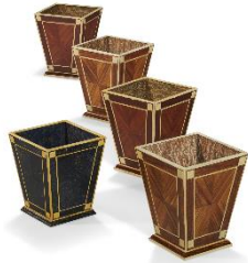
A GROUP OF FIVE FAUX AND CREAM PAINTED WASTE BASKETS 20 TH CENTURY, SUPPLIED BY HENRI SAMUEL