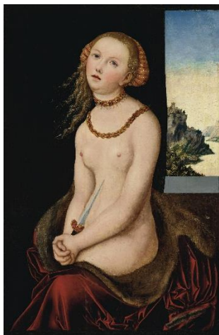
LUCAS CRANACH I (KRONACH 1472-1553 WEIMAR) LUCRETIA