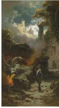
CARL SPITZWEG (GERMAN, 1808-1885) DER HEXENMEISTER