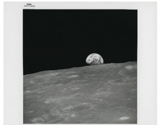
Lot 217, The first human-taken photograph of Earthrise, December 21-27, 1968. WILLIAM ANDERS [APOLLO 8]. Estimate: £20,000-30,000

Victor Martin-Malburet commented: "The astronauts are often portrayed as great scientists and heroes, but rarely are they hailed as some of the most significant photographers of all time. The early pioneers of Mercury and Gemini were given as a canvas space and the Earth; the Apollo astronauts an alien world. From the thin protections of their space capsules and EMUs (Extravehicular Mobility Units), they captured, with skill and daring, photographs which immediately embraced the iconography of the sublime, inspiring awe and wonder."