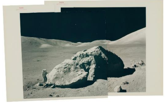
Lot 655, Panoramic view of Harrison Schmitt, Tracy's Rock and the Lunar Rover, station 6, December 7-19, 1972, EVA 3. EUGENE CERNAN [APOLLO 17]. Estimate: £4,000-6,000

Voyage to Another World Part I (open for bidding from November 6 to 19) features Projects Mercury, Gemini and Apollo, from the birth of the Space Age to Eagle's landing on Apollo 11, including Apollo 8, the first mission when humans left Planet Earth and explored deep space and lunar orbit. Voyage to Another World Part II (open for bidding from November 6 to 20) features missions Apollo 11 to Apollo 17, from Neil Armstrong's first step to Eugene Cernan's last step on the Moon, including the great voyages of exploration with the Lunar Rover which allowed the astronauts to travel dozen of kilometres on the lunar surface.