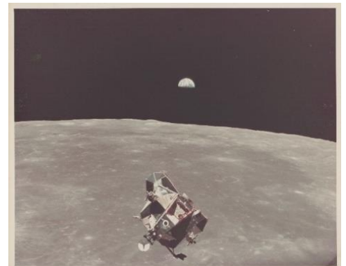
Lot 373, LM Eagle and Earthrise, July 16-24, 1969, MICHAEL COLLINS [APOLLO 11]. Estimate: £1,500-2,500