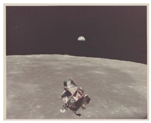
Lot 373, LM Eagle and Earthrise, July 16-24, 1969, MICHAEL COLLINS [APOLLO 11]. Estimate: £1,500-2,500