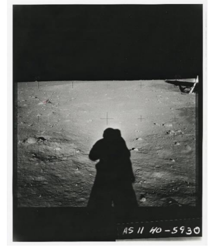
Lot 357, 360° panoramic sequence in the Sea of Tranquillity, July 16-24, 1969, NEIL ARMSTRONG [APOLLO 11]. Image 1 of 10 in the panoramic sequence Estimate: £10,000-12,000