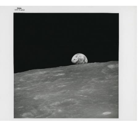
Lot 217, The first human-taken photograph of Earthrise, December 21-27, 1968. WILLIAM ANDERS [APOLLO 8]. Estimate: £20,000-30,000

Victor Martin-Malburet commented: "The astronauts are often portrayed as great scientists and heroes, but rarely are they hailed as some of the most significant photographers of all time. The early pioneers of Mercury and Gemini were given as a canvas space and the Earth; the Apollo astronauts an alien world. From the thin protections of their space capsules and EMUs (Extravehicular Mobility Units), they captured, with skill and daring, photographs which immediately embraced the iconography of the sublime, inspiring awe and wonder."