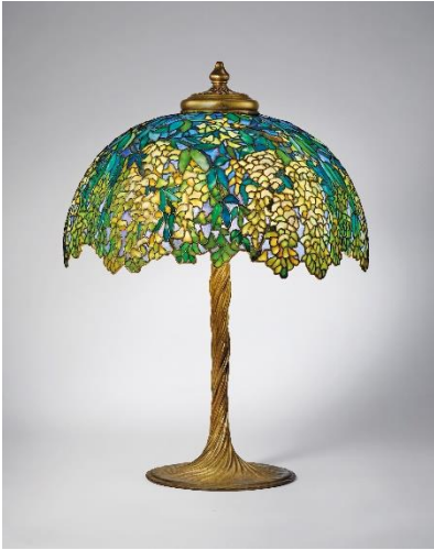
TIFFANY STUDIOS 'Laburnum' table lamp with 'Twisted Vine' base, c. 1915, leaded glass, gilt-bronze $200,000-300,000