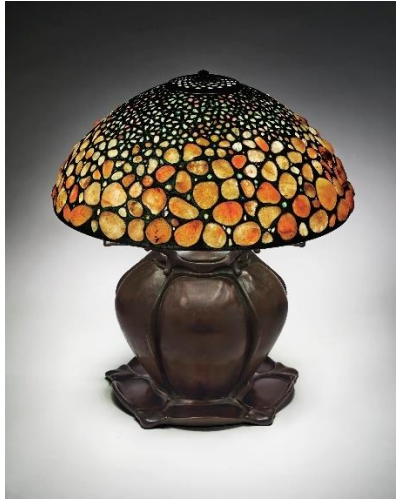
TIFFANY STUDIOS 'Pebble' table lamp with 'Pepper' base, c. 1901-1904, Favrite and leaded glass, patinated bronze $100,000-150,000