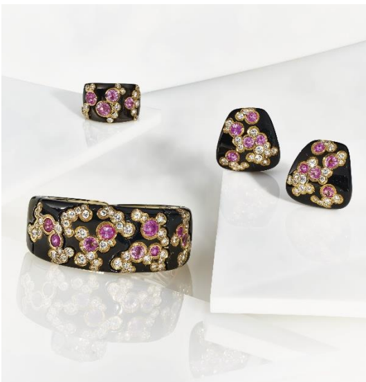
MARINA B Suite of coloured sapphire and diamond 'Fuji Yama' jewellery Estimate: $20,000-30,000