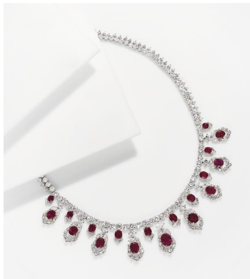
CARTIER Burma ruby and diamond necklace, circa 1955 Estimate: $150,000-250,000