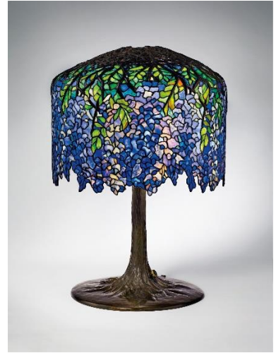
TIFFANY STUDIOS 'Wisteria' table lamp with 'Tree' base, 1905, leaded glass, patinated bronze $500,000-700,000